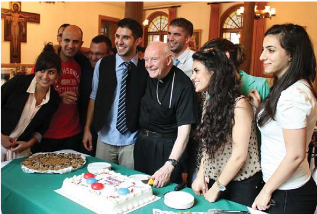
During a festive celebration July 3 at the Franciscan Monastery of the Holy Land in Washington, D.C., Cardinal Theodore McCarrick, archbishop emeritus of Washington, celebrated his 83rd birthday with Palestinian students from Bethlehem University. The students, under the sponsorship of Catholic Charities USA, worked in 10 dioceses in the United States during the summer. See http://cnsblog.wordpress.com/2013/07/03/catholic-charities-usa-bethlehem-university-internships-let-students-see-catholic-social-services-on-the-ground/.

For more about the annual Oriente Lumen Conferences and OLTV's "Eastern Churches 101" video project, please investigate the site of Eastern Christian Publications, http://ecpubs.com/index.html .