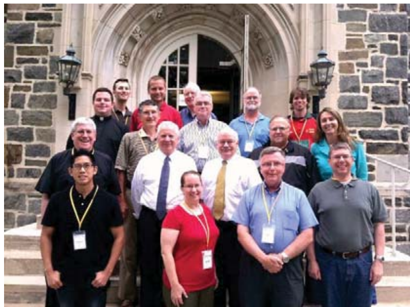
Participants in the Advanced CADEIO Summer Institute, July 7–13, 2013, St. Paul's College, Washington, DC.

One of the speakers made the provocative comment that if one is fully engaged in ecumenical dialogue one might be tempted to convert to the other side of the table. By this he meant that you should put yourself in the shoes of the other and try to