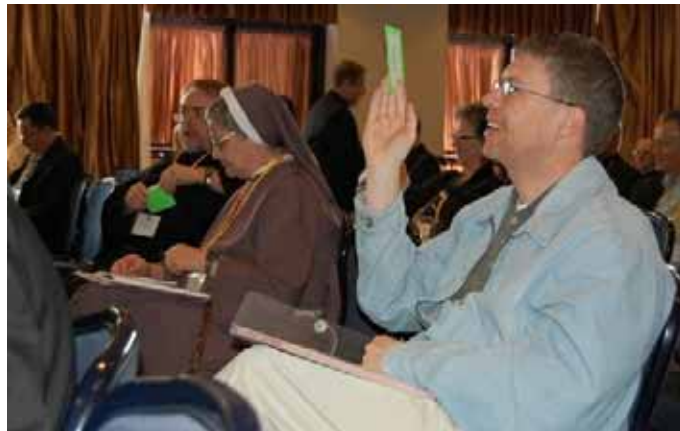
Voting for officers at the CADEIO General Assembly.