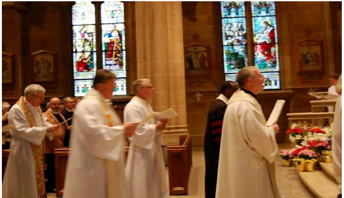
Procession for Evening Prayer opening the National Workshop on Christian Unity 2013 in Columbus, Ohio, April 8–11.