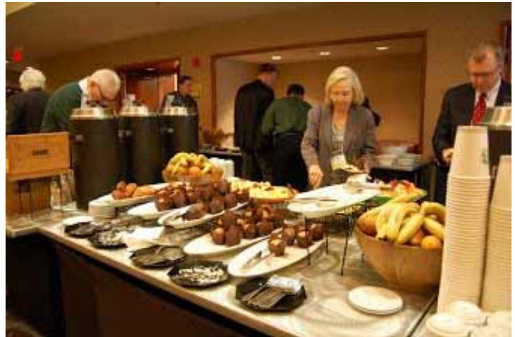
Graymoor Ecumenical and Interreligious Institute continued the tradition of generously sponsoring Tuesday's breakfast.