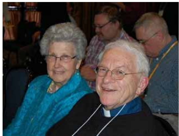
The CADEIO general assembly convened Tuesday afternoon.