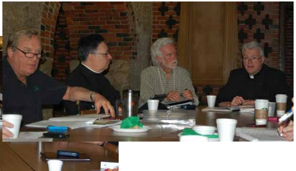
Monday’s board of directors meeting in the undercroft of St. Joseph Cathedral.