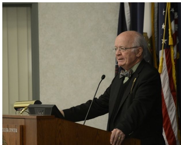
Dr. Martin Marty presents during the LARC Day.