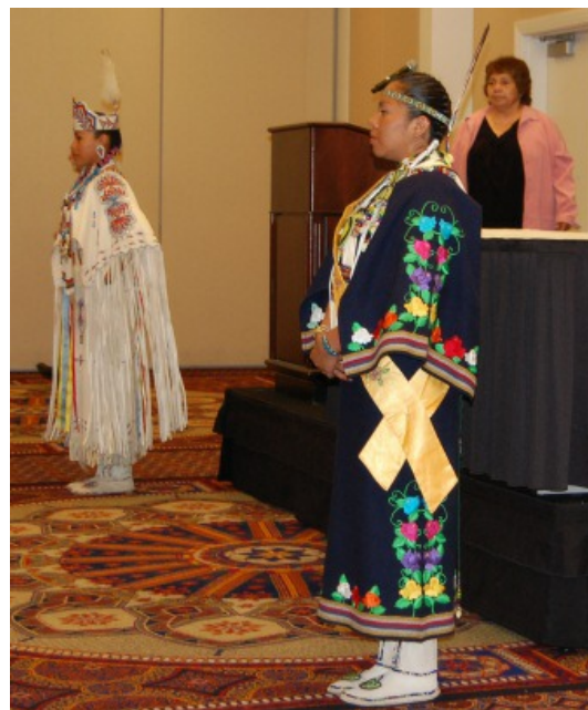
Members of the Anadarko Public Schools Indian Education Dance Troop perform the “Our Father.”