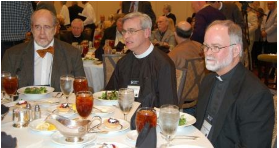
This year's CADEIO luncheon was replaced by a plenary luncheon for all workshop participants.