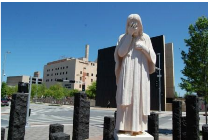
Jesus Wept statue outside Old St Joseph's Cathedral to commemorate the bombing of the Alfred P. Murray Federal Building on April 19, 1995