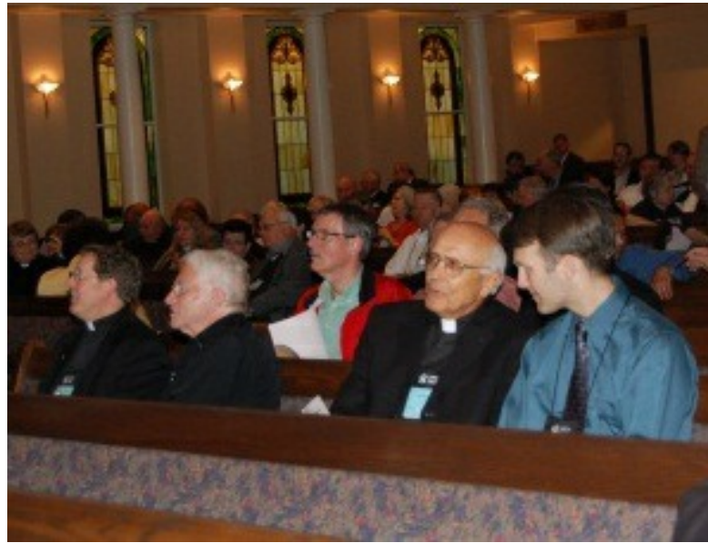
CADEIO members sit in the front row at the opening worship.