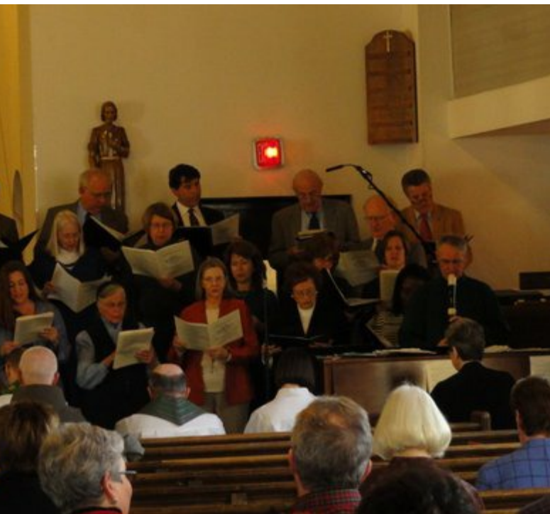
at the annual ecumenical celebration of the Word of God in Bethesda,

On the same day, First Presbyterian Church of Vero Beach was the host of a Unity Prayer Service. Holy Cross Catholic Church, Christ by-the-Sea Methodist Church, and Christ Church, all of Vero Beach, also participated.