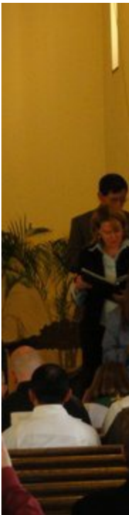
The Unity Choir Maryland.