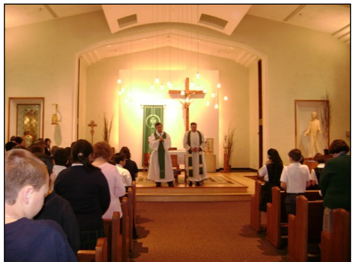
Ecumenical youth confirmation class gathering at St. Mary Roman Catholic Church, Riverside, Illinois.

For the complete homily, see http://www.lstc.edu/chapel/sermons/?a=sermon&id=241 .