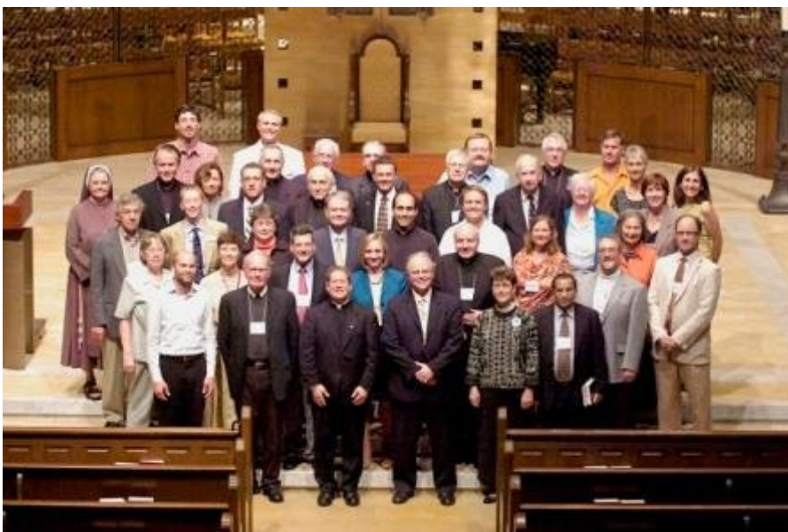
Participants and presenters at A Century of Ecumenism, St. Paul Seminary, June 17–19.

One highlight of this recent conference was its prayer service to offer thanks for this movement of God and to ask God’s ongoing help. It was noted that at the Edinburgh Conference no agreements were signed. The only action taken was a virtually unanimous decision to continue