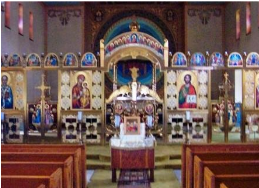
The chapel of Ss. Cyril and Methodius Byzantine Catholic Seminary in Pittsburgh, where the officers were billeted.

While in Pittsburgh, the officers from out of town had a chance to visit the venues for the various events. One of the best aspects of the site is that the hotel is located in a tourist park called Station Square. A variety of restaurants are available right outside the hotel door, and the venues for the events are in walking distance but are also available by public transit for a nominal fee. The social, a boat ride on the three rivers of Pittsburgh, leaves from a dock beside the hotel.