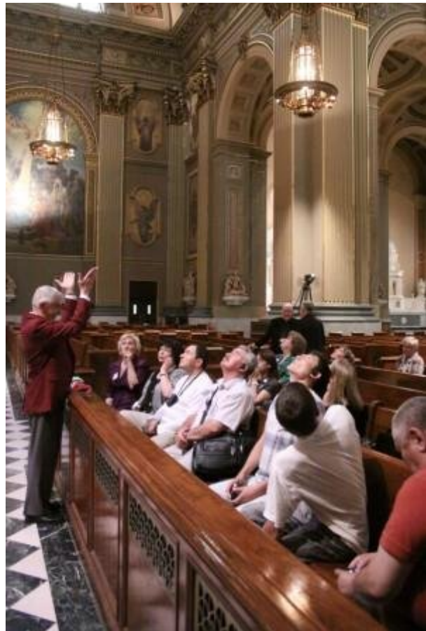
The delegation visits the Cathedral Basilica of SS. Peter and Paul in Philadelphia.