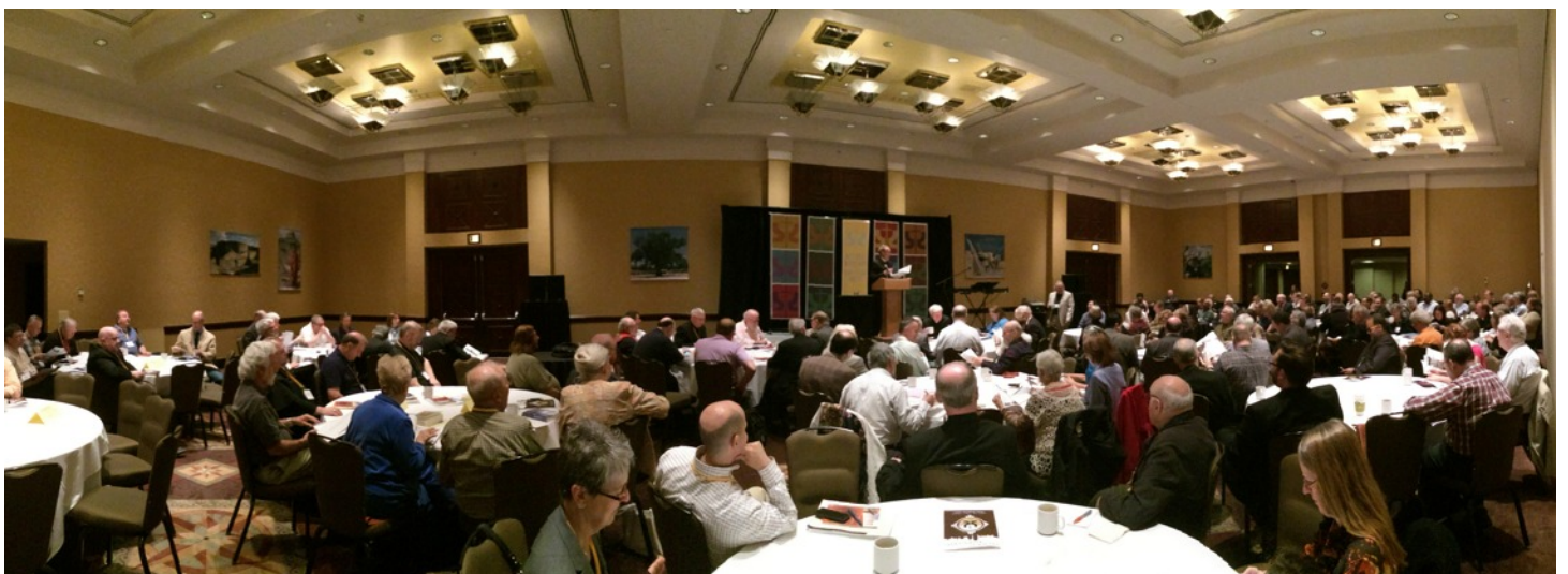
The NWCU 2014 opening plenary, Tuesday, April 29.