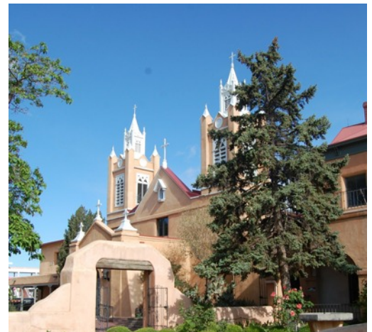
San Felipe Church, site of the CADEIO Board of Directors Meeting, April 28.

tions occurred on the first day of the NWCU, Monday, April 28, the magic officially began with the Opening Worship and Reception that evening at the Cathedral of St. John Episcopal Church in Albuquerque, New Mexico. A native choir from Laguna Pueblo partici-