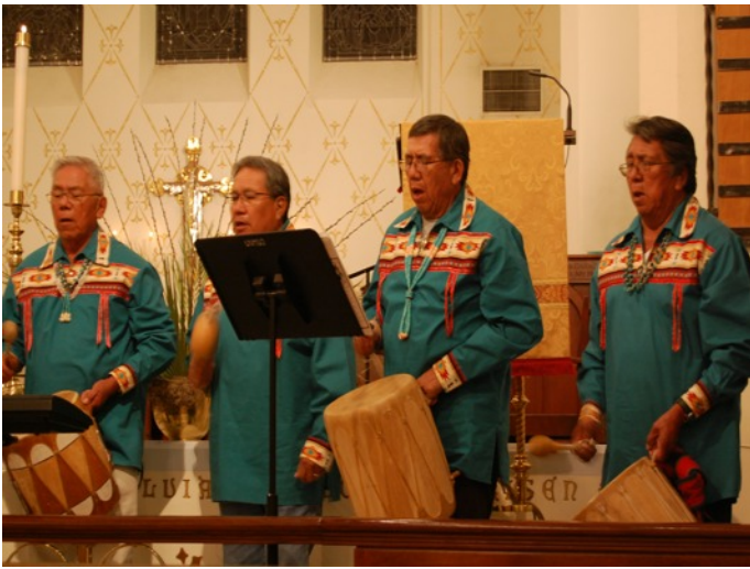
Drummers accompanied the choir from Laguna Pueblo that provided music for the Opening Worship at St. John Episcopal Church, April 28.