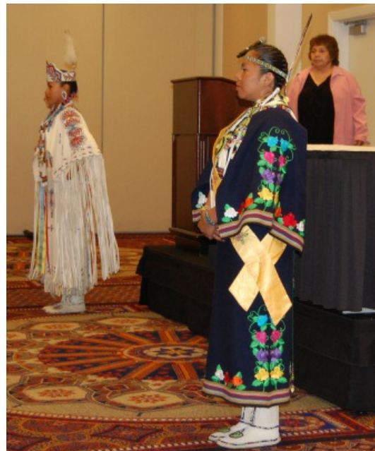
Members of the Anadarko Public Schools Indian Education Dance Troop perform the “Our Father.”